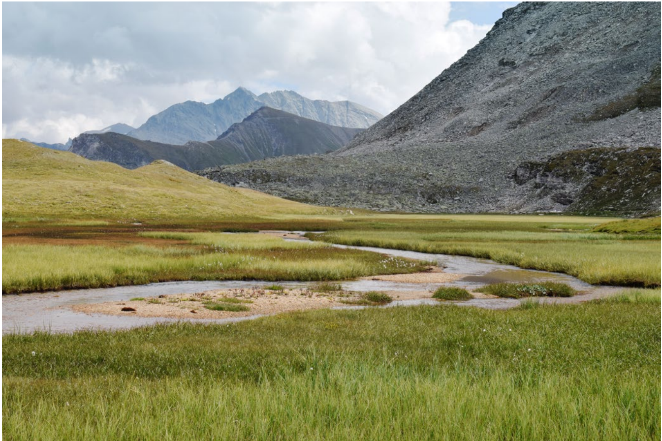
Fig. 4. – Alpine alluvial plain of Lona, with fens, alluvial and spring vegetation patches on both sides of the meandering Torrent de Lona.

Alps. Despite the tiny axillary process, SAARELA et al. (2017) place other tetraploid forms of C. stricta aggregate close to C. canescens (Weber) Roth and C. villosa (Chaix) J.F. Gmel., i.e., to species that do not possess an axial process. However, the subspecies that often shows small growth, C. stricta subsp. groenlandica , lies outside this clade (SAARELA et al., 2017), which implies a clearer delimitation from C. stricta . Further genetic studies should better resolve the C. stricta aggregate and provide more clues to the taxonomic position of the new species found in the alluvial plain of Lona.