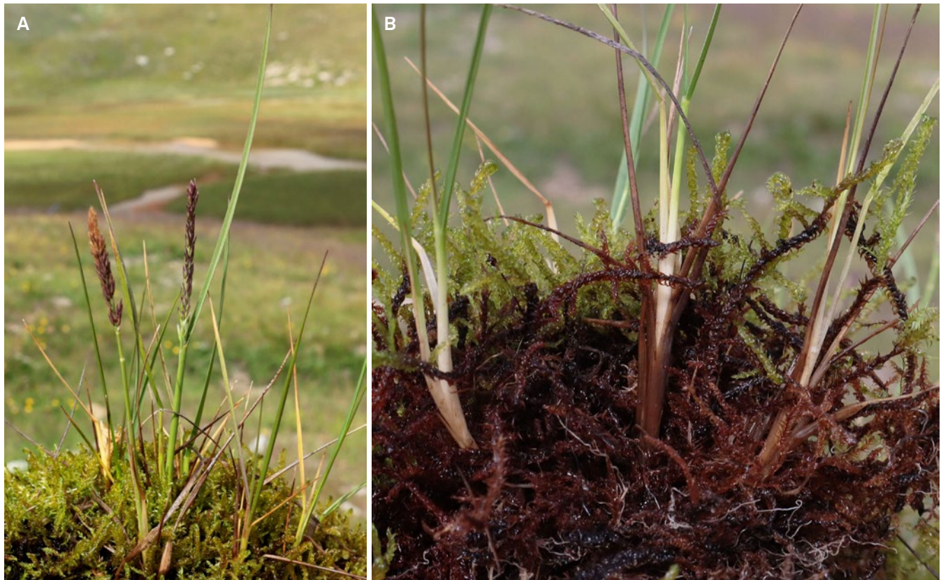
Fig. 3. – Calamagrostis lonana Eggenb. & Leibundg. A. Habit of the aerial parts with moss cushion of Warnstorfia exannulata (Schimp.) Loeske. B. Upper root space in the moss layer.

widespread calcareous sediments in the area. The examined soil profiles of Calamagrostis lonana growth sites always show a similar structure: a 10–15 cm thick moss layer (Fig. 3) is directly followed by a layer of grey alluvial loam more than 50 cm deep, intermixed with dead mosses probably from earlier inundations. The pH value remains unchanged over the entire profile depth (pH 6.5). Roots of C. lonana were found both in the moss layer (Fig. 3) and in the alluvial loam and can be detected down to a depth of about 40 cm. The root mass of Calamagrostis in a more closely examined soil sample was between 0.11 g (top layer) and 0.02 g or 0.04 g (lower layers) per 100 g of soil material. Whether during inspections at the beginning of August, in September or at the beginning of October the soil was always found to be completely water saturated.